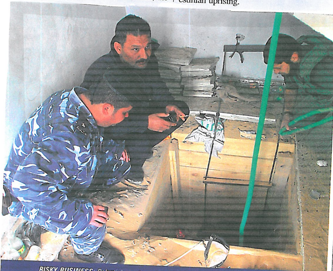
RISKY BUSINESS: Palestinian police uncover a weapons-smuggling tunnel in Gaza, but is it a real attempt to fight terror or just a show?

Critics of the pullout warn that if Israel abandons the Philadelphia Corridor, terror groups will quickly rearm for the next Palestinian uprising.