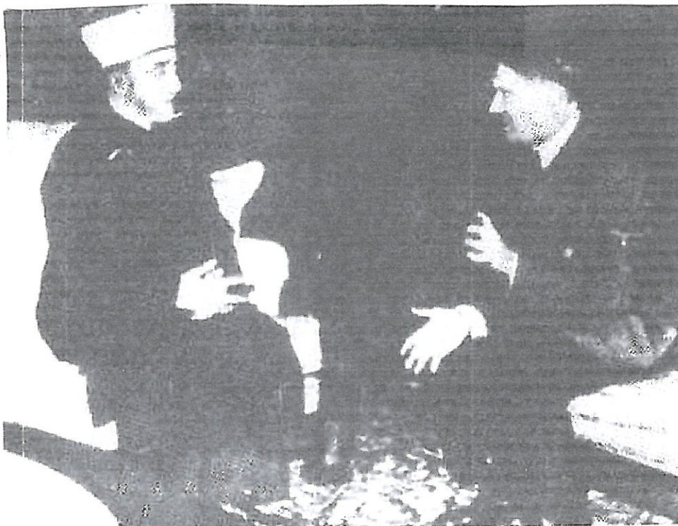
The Mufti of Jerusalem salutes the Bosnian SS division