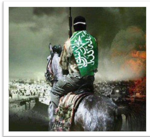
“Prophecies of Anti-christ”