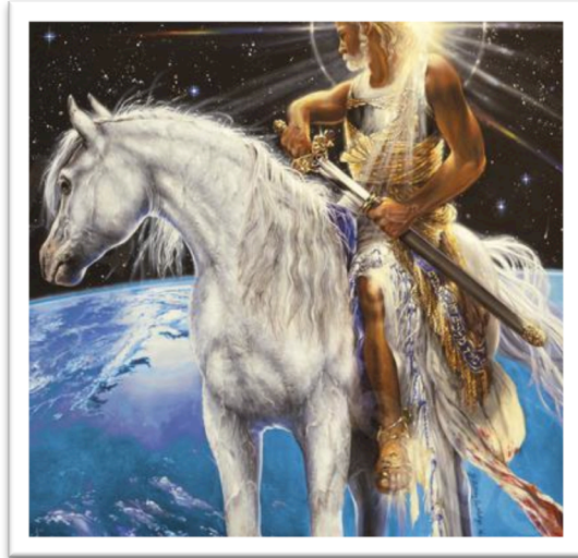
“Prophecies of Christ”