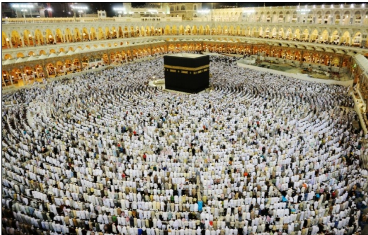
The False Image of the Beast in Mecca, Saudi Arabia

11 And the smoke of their torment will rise forever and ever. There will be no rest day or night for those who worship the beast and its image, or for anyone who receives the mark of its name.