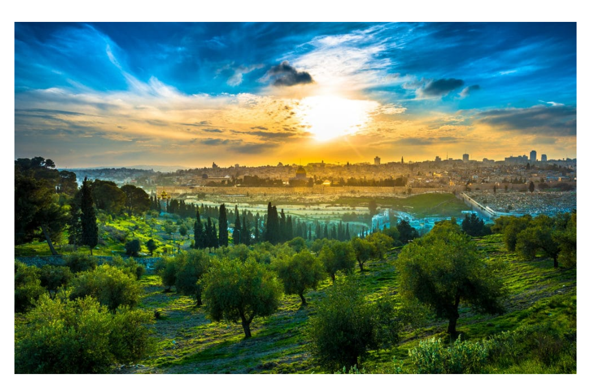
"Treasures in Isaiah" Chapters 25-28 "In this Mountain" "On That Day"

"Open the gate, that the Righteous Nation which keeps the Truth may enter in" Isaiah 26:1